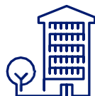
Public & Private Companies